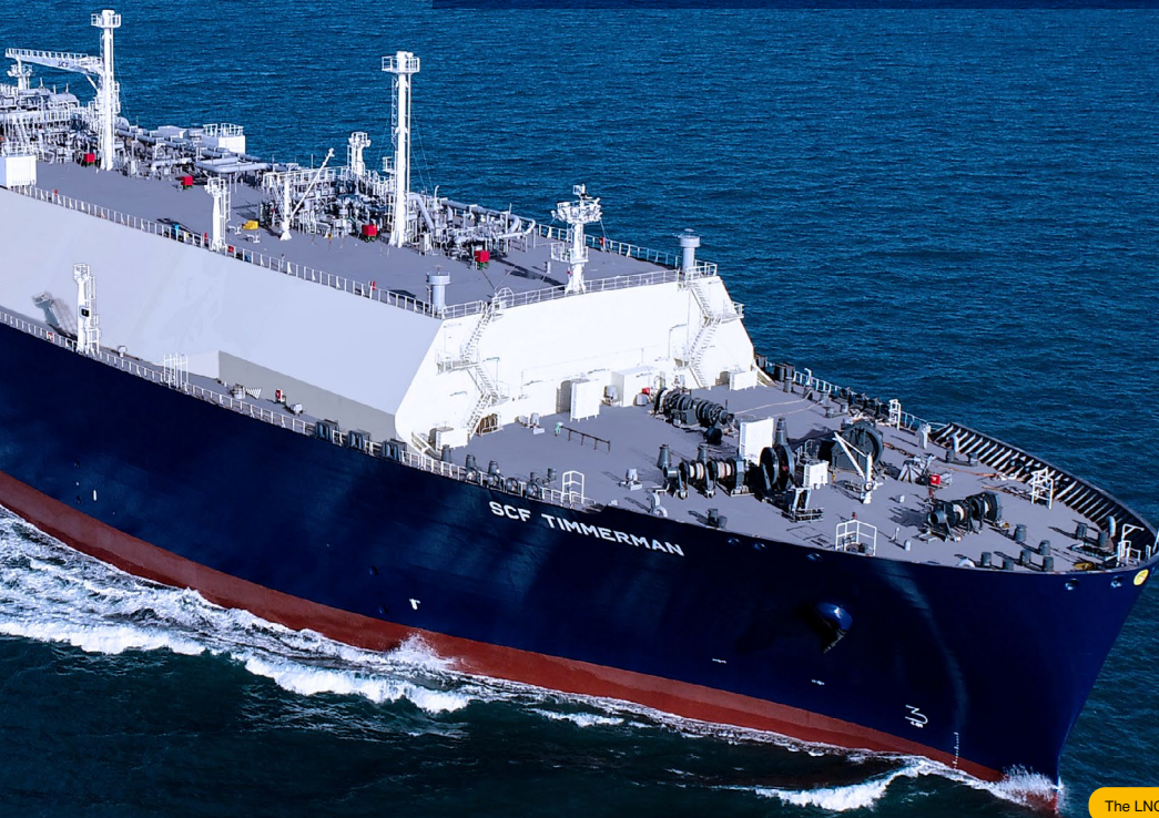
The LNG carrier SCF Timmerman was delivered on 15 January 2021.