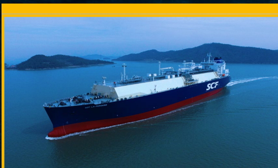
The LNG carrier SCF La Perouse was delivered on 10 February 2020